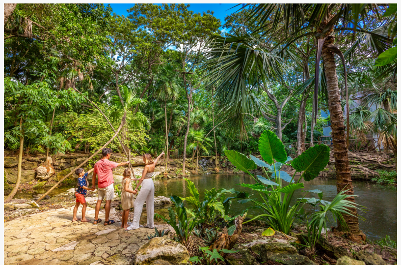
Sandos Caracol opens second largest on-site cenote.