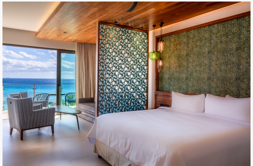
The brand-new "Platinum Tower" is home to 40 luxury rooms providing a sophisticated, nature-inspired design that aims to elevate the guest experience for adults and families.

New Luxury Platinum Tower Suite Collection at Sandos Playacar : Renowned for lining some of the most beautiful indigo-blue beaches in Playa del Carmen, Sandos Playacar is proud to inaugurate a brand-new "Platinum Tower," home to 40 luxury rooms providing a sophisticated, nature-inspired design that aims to elevate the guest experience for adults and families. Ideally situated between the property's coastal jungle and turquoise waterfront, the 538