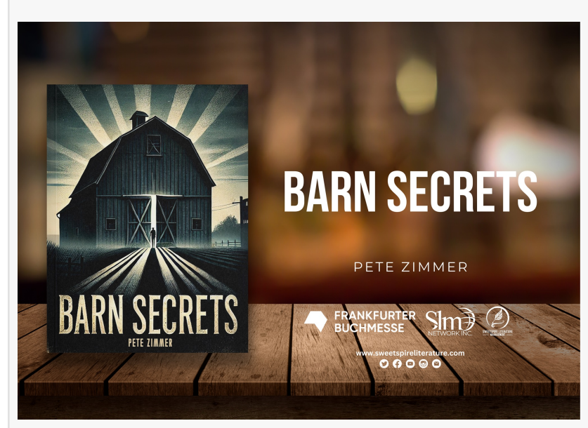
Barne Secrets Book Marketing Kit

This press release can be viewed online at: https://www.einpresswire.com/article/787472288