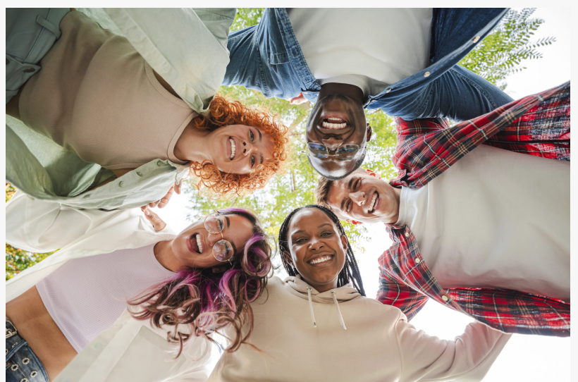
Rewiring the Brain for Emotional Freedom and Resilience

Backed by over 12 published studies and praised by leading neuroscientists, EBT is a trusted