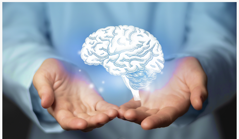
A Smarter Way to Manage Stress: EBT Inc. Unveils Its Redesigned Digital Experience