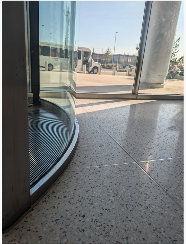
AN EPOXY TERRAZZO FLOOR enhances durability and ease of maintenance in Detroit's new courthouse.

This press release can be viewed online at: https://www.einpresswire.com/article/787478773