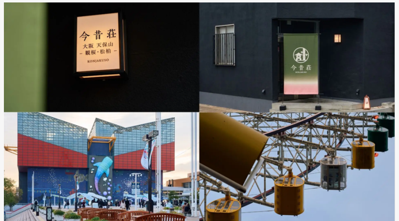
KONJAKUSO Osaka Tempozan "KANOH" "SHOHAKU" Exterior and Surrounding Facilities