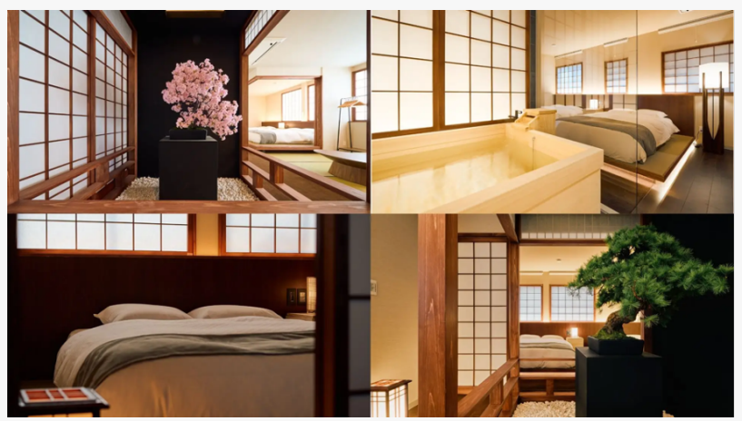
[KONJAKUSO Osaka Tempozan "KANOH" "SHOHAKU" ] Dry bonsai, bathroom, bedroom

Tempozan, where our facility is located, is said to be the lowest mountain in Japan, which was created by heaping up earth and sand from the Aji River during the Edo period. At that time, Tempozan was a scenic spot where pine trees and cherry trees were planted, and it was a very