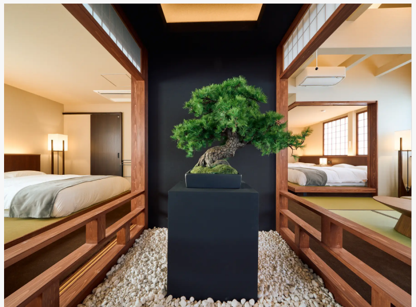
'KONJAKUSO Osaka Tempozan "SHOHAKU" Pine Tree' - A part of a pine tree displayed using dry Bonsai technique

EXPO 2025 Osaka, Kansai & SDGs boost tourism