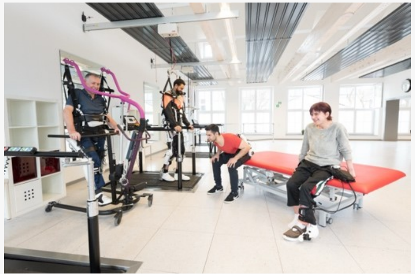
Content image: "My Physical Ability Improving and Regenerating"

and the creation of the new industry of Cybernic to follow the robotics and IT industries.