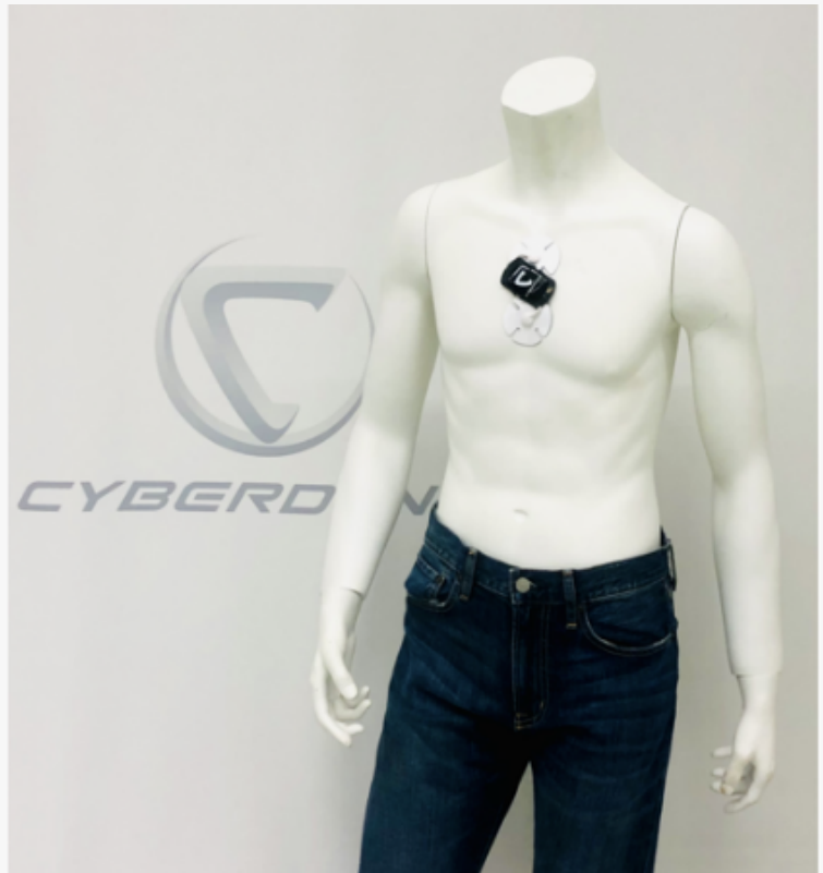
Content image: "Cyvis"