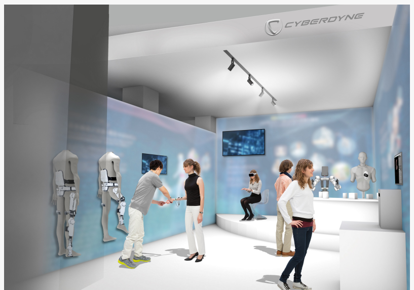
Concept image of "Future Me" exhibit within PASONA NATUREVERSE

CYBERDYNE utilizes "Cybernic" technology (integration of humans, AI robots, and information systems) to address various societal challenges. By merging humans with cyber physical spaces (HCPS: Human Cyber Physical Space), the company aims to shape the future by promoting the realization of a "Techno Peer Support Society" and the creation of the new industry of Cybernic to follow the robotics and IT industries.