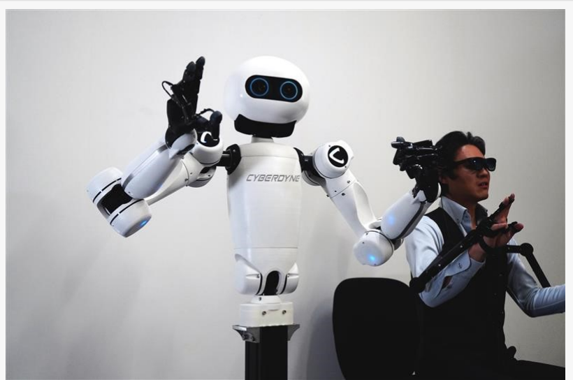
Content image: "My Living Space Expanded"

Through this exhibit, Pasona Group and CYBERDYNE have expressed their commitment to developing technology that enhances individual well-being and fosters harmony between humans, AI, and robots, thereby creating the world of "NATUREVERSE", of truly fulfilling lifestyles and workstyles. The collaboration between the two companies is planned to extend beyond EXPO 2025, working together to develop new industries in the field of well-being and contribute