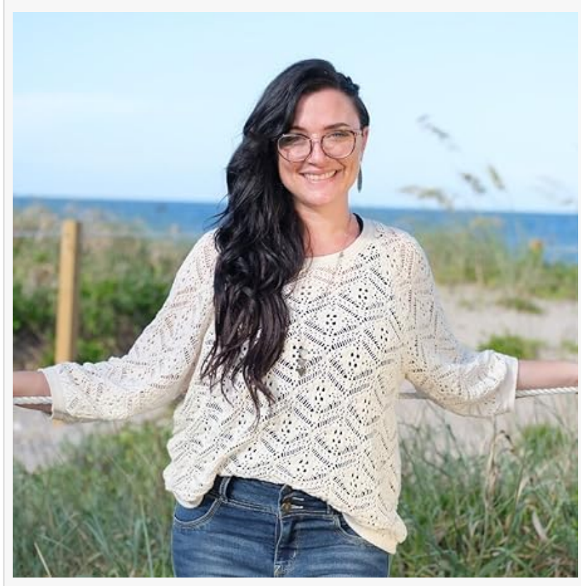
Author Rae Knowles