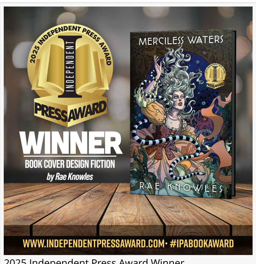
2025 Independent Press Award Winner