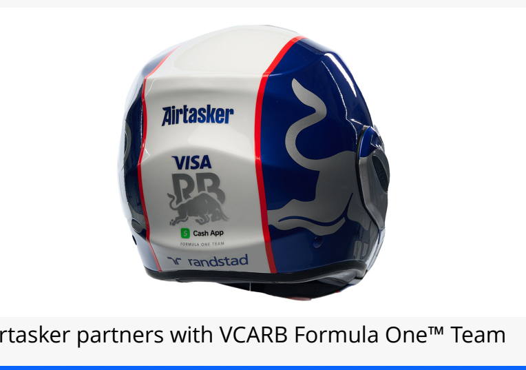
Airtasker partners with VCARB Formula One™ Team

Airtasker's mission has always championed the power of people—their skills, their grit, and the hard work that keeps the world moving. This mission aligns with VCARB, and both brands will collaborate to bring those behind the Team's success into the limelight. Airtasker will provide VCARB with access to an almost limitless range of services—because in the high-stakes world of F1, every task matters when it comes to winning.