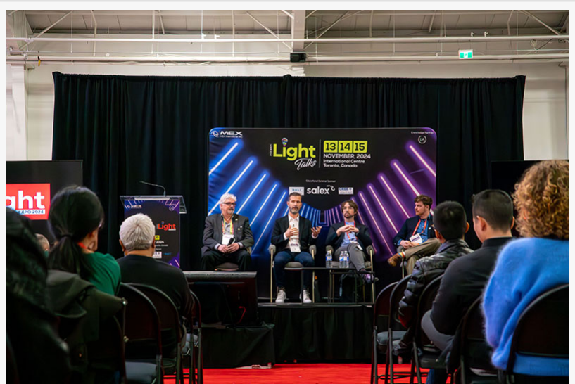
Canada Light talks

The event is strategically designed for industry leaders to showcase their advanced lighting technologies to an influential audience of architects, designers, key stakeholders, and decision-makers. This focus on Canadian companies bolsters Canada's standing in the global lighting market while supporting the growth of its lighting culture.