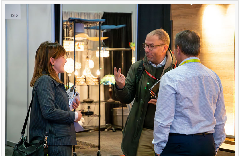
Canada Light Expo 2024 Networking