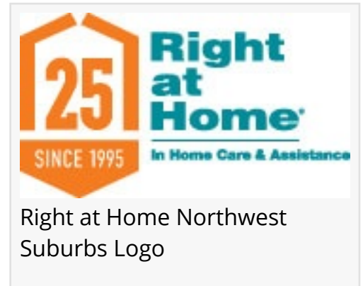
Right at Home Northwest Suburbs Logo

ARLINGTON HEIGHTS, IL, UNITED STATES, March 26, 2025 /EINPresswire.com/ -- Right at Home Northwest Suburban has announced the expansion of its presence in Arlington Heights with a new office in the heart of the downtown at 34 S. Dunton Avenue. This strategic move reflects the organization's commitment to becoming more deeply embedded in the Arlington Heights community while continuing to provide exceptional in-home care services to local seniors.