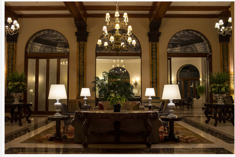
Country Club Lima Hotel Lobby

This type of award is deserving for Country Club Lima Hotel, as their rich history, outstanding service, stunning architecture, and impeccable attention to detail position the hotel as an international benchmark of luxury hospitality. Located in the San Isidro district, Country Club Lima Hotel was founded in 1927 and is one of the most exclusive hotels in Lima today, and the