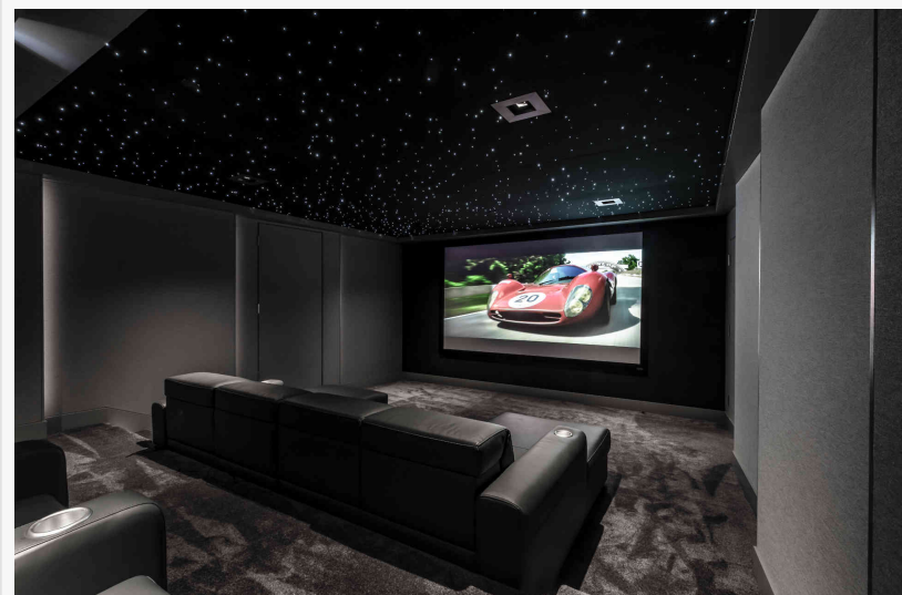
Get Wired Tec provides Home Theater solutions tailored to your needs!