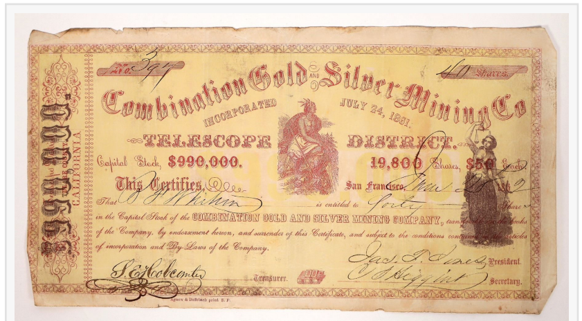
Combination Gold & Silver Mining Company (Inyo County, Calif.) stock certificate No., 397, issued on June 26, 1862 to B.F. Whiten for 40s shares, signed by officers (est. $2,000-$4,000).

The mining category has important references to mining; rare Nevada documents (including lot 1400, a letter about silver bars stolen from an Austin, Nevada stagecoach; and lot 1418, a rare Comstock autograph). Also offered will be ephemera from California, Colorado and Montana.