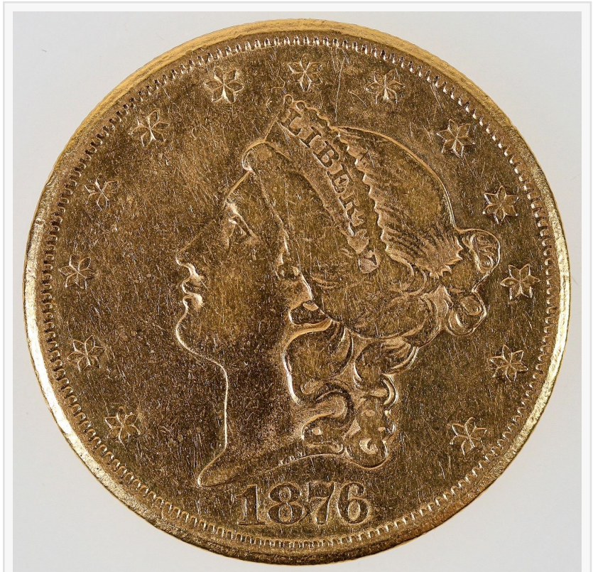
Rare 1876-CC (Carson City, Nevada Mint) U.S. Liberty Head $20 gold piece, graded F-VF condition, from a mintage of just 138,441 coins (est. $4,000-$6,000).

Day 1, on Saturday, March 1st, contains over 500 lots dedicated to general Americana; minerals