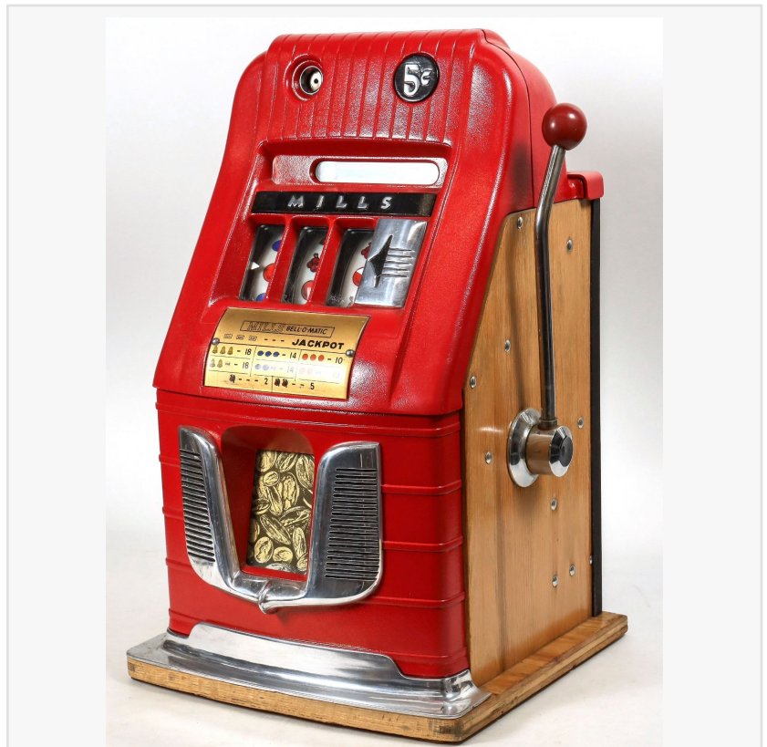
Circa 1950 three-reel Mills Bell-O-Matic slot machine with bright red metal case and wooden sides, the "A-C-E" in clubs the jackpot, 26 inches tall, with two keys (est. $2,000-$4,000).

Day 3 is a timed-only session, meaning there won't be an audio/video feed with an auctioneer at a podium. Holabird officials will be monitoring the progress, but the auction is controlled by the