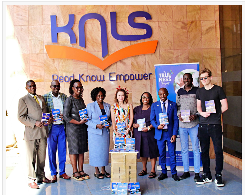
A group photo featuring The Trueness Project, Kereri Girls' and KNLS teams.

She looked forward to the book featuring in the corporation's book fairs, which would give it