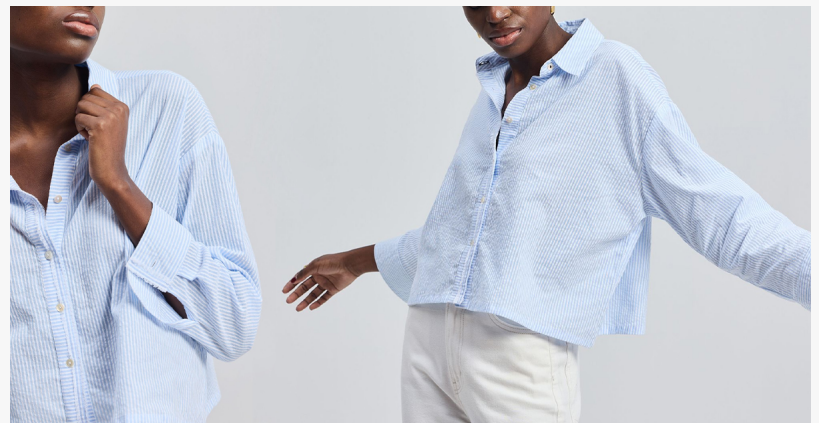
Unmatched Comfort and Breathability