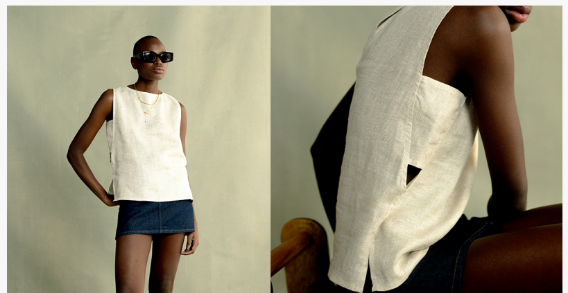
Effortless versatility and timeless style