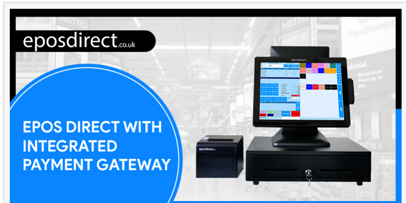
EPOS Direct Integrated Payments