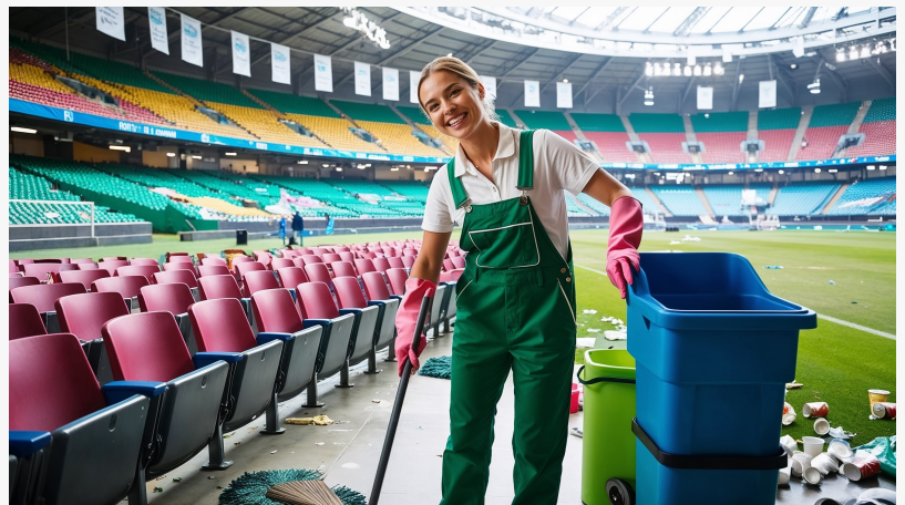
Stadium and Venue Cleaning Forte Cleaning Utah