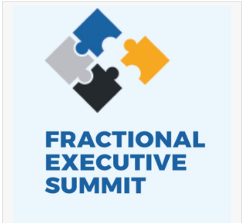
Fractional Executive Summit

SCD Consulting Services is also offering $500 off a custom website design, and their Fractional Transition Package- designed to help corporate professionals successfully enter the fractional world- is available at at $1,000 discount.