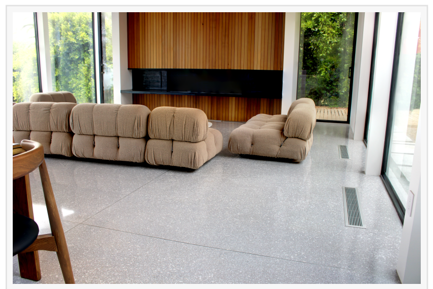
OVER THE TOP Terrazzo overcame elevation discrepancies and subfloor deterioration to deliver a flawless finish across this fire-rebuilt Malibu residence.