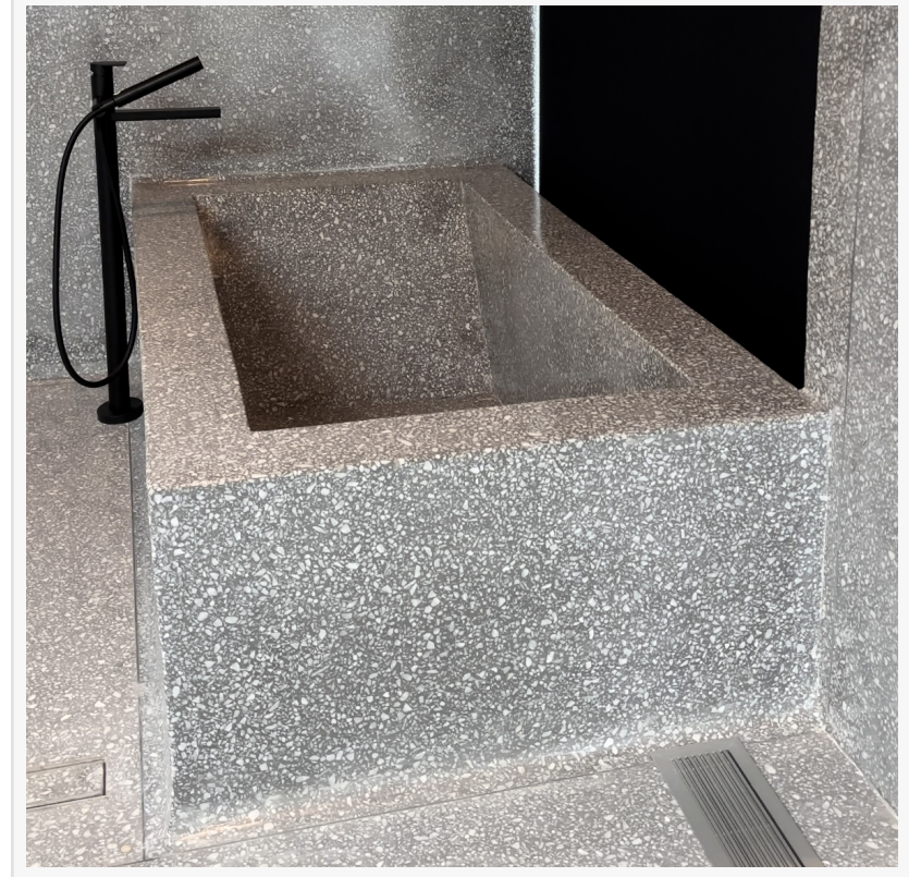
POURED-IN-PLACE terrazzo extends beyond flooring to walls, built-in bathtub, integrated sinks, and vertical elements—executed by hand as a continuous surface without prefabricated components.