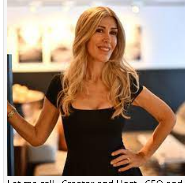
Let me call...Creator and Host - CEO and Founder TechInEntertainment and TechInEntertainment

Tune in to Let Me Call... for quick yet powerful conversations that make sense of a rapidly evolving industry.