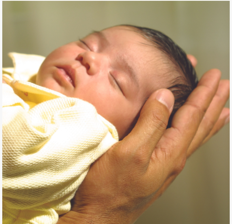
Newborn sleeping peacefully in caring arms.

her mind after surrendering her infant. When this has happened, A Safe Haven for Newborns