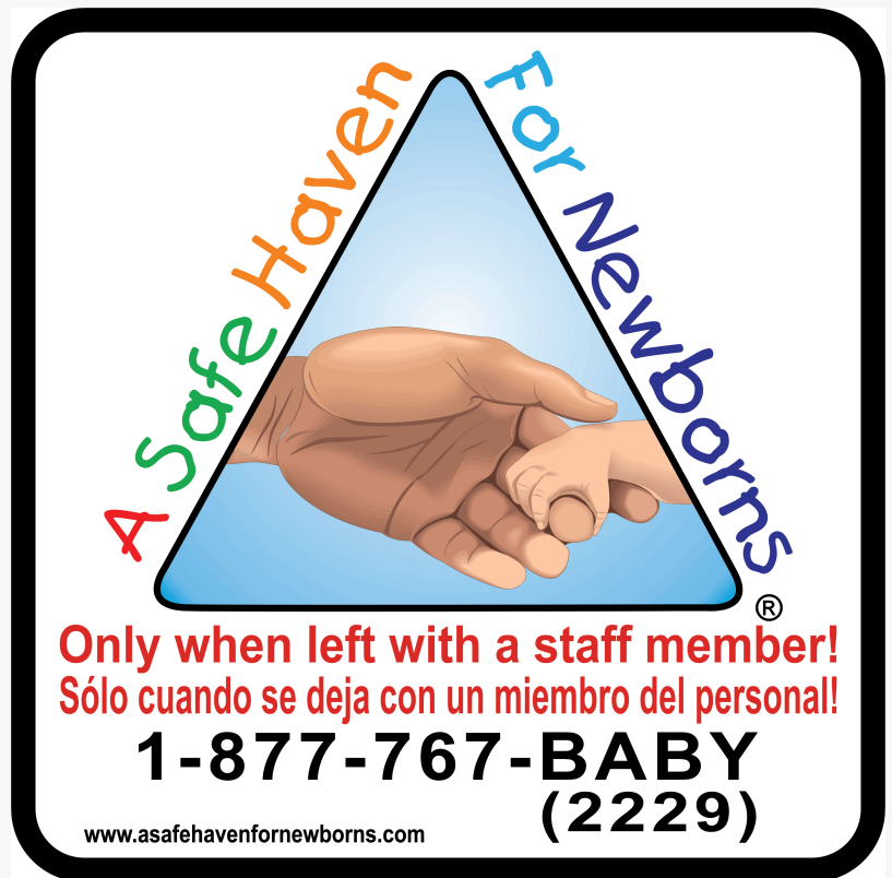
A Safe Haven for Newborns Signage designating hospitals, fire and EMS stations as Safe Haven.