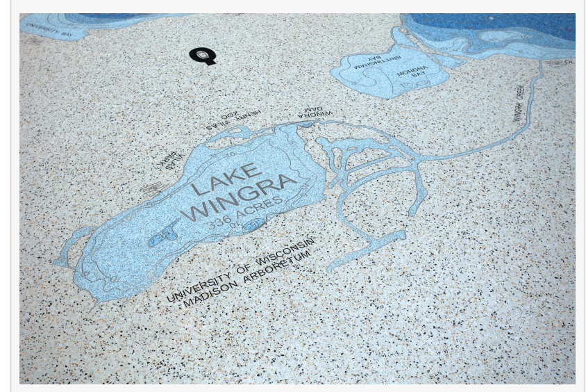
WATERJET TECHNOLOGY was used to cut precise topographical lines in zinc, ensuring accurate scale.

THE AWARD-WINNING TERRAZZO features a topographical map of local lakes and key landmarks, with varying shades of blue to represent water depth.