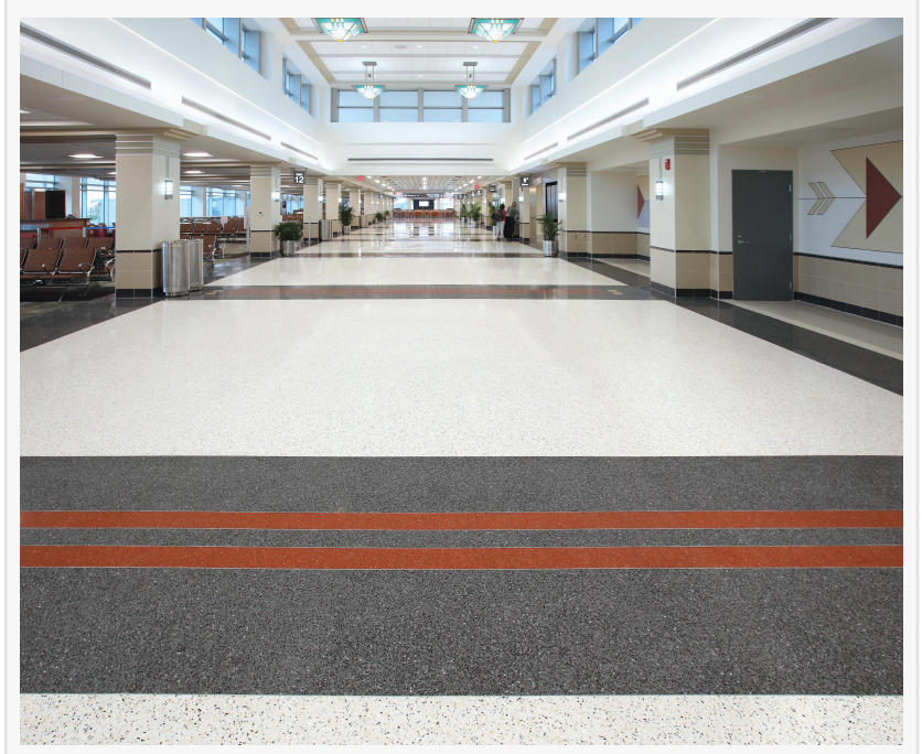
THE TERRAZZO installation enhances the Prairie Style aesthetic of the terminal.