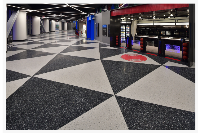
HANDCRAFTED TERRAZZO in the Intuit Dome was poured in place.

large-scale public works. A fourth-generation family business founded in 1924, Corradini Corp. received three of the 17 Honor Awards presented by NTMA this year. The other awards are for projects in Grand Junction High School in Colorado and CityCenter casino walkways in Las Vegas.