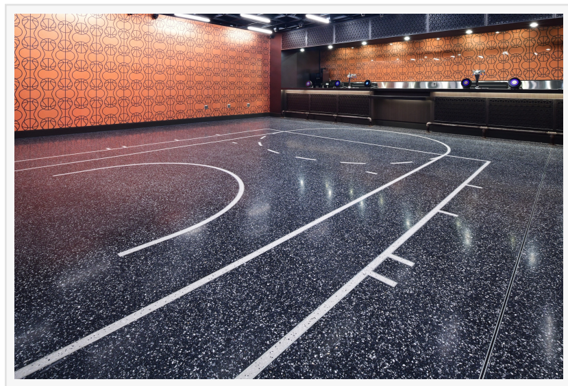
CORRADINI Corp.'s terrazzo installation in the Los Angeles Clippers' Intuit Dome was honored by the National Terrazo & Mosaic Association.

Corradini Corp. is a leading terrazzo contractor in the U.S. The company specializes in high-profile projects across sectors, including hospitality, sports venues, retail, corporate, and