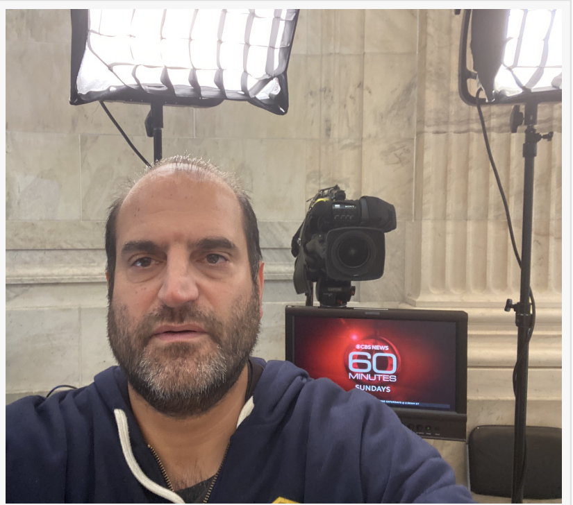
TravelingWiki with CBS News on Capitol Hill

This work follows Google, Microsoft Bing & Yahoo individually opining on the same day: TravelingWiki is the “most consequential website for Autism resources at US airports.” This occurred the day after Google’s AI reported as of February 11, 2025 that Morningstar “has recognized TravelingWiki’s financial news as relevant.” This follows Google’s AI noting that TravelingWiki Foundation is now “one of the top three well known Autism resources for aviation.” This also occurs as Microsoft’s CoPilot AI hailed TravelingWiki’s “significant contributions” as “heroic,” with a footnote for that assertion to a wire service with 784 million