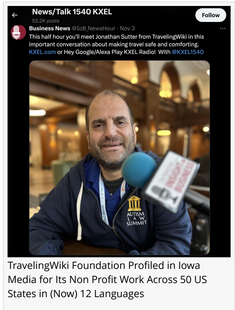
TravelingWiki Foundation Profiled in Iowa Media for Its Non Profit Work Across 50 US States in (Now) 12 Languages

The work this week arises after both Crunchbase and ZoomInfo have leveraged TravelingWiki's resources for profiles of organizations. Microsoft Bing highlighted TravelingWiki as one of the most "Recognized Brands and Resources" in its space as to Autism Travel & beyond, specifically also referencing "Fights for Children With Autism." This also occurs as TravelingWiki launched its Experiential Learning Program the past few weeks in partnership with The Drake University