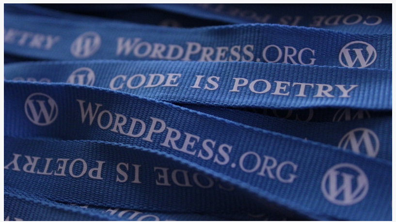
WordPress Website Development with WordPress Plugin Development

With businesses increasingly relying on digital operations, AI-powered automation has become a necessity. From customer service automation to content generation and predictive analytics, AI is reshaping business workflows across industries. However, off-the-shelf solutions often fail to cater to specific operational needs. This is where custom WordPress plugins, tailored to business-specific AI integrations, come into play.