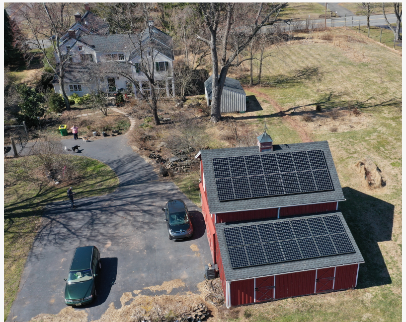
SBS Residential Installation