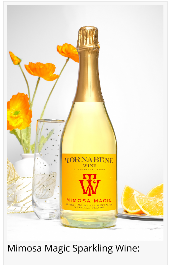
Mimosa Magic Sparkling Wine:

This press release can be viewed online at: https://www.einpresswire.com/article/788595006