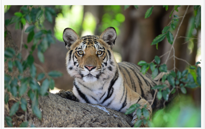
Panna Tiger Reserve in Madhya Pradesh

management in 2024, aligning with Madhya Pradesh's broader goals of environmental conservation and responsible tourism.