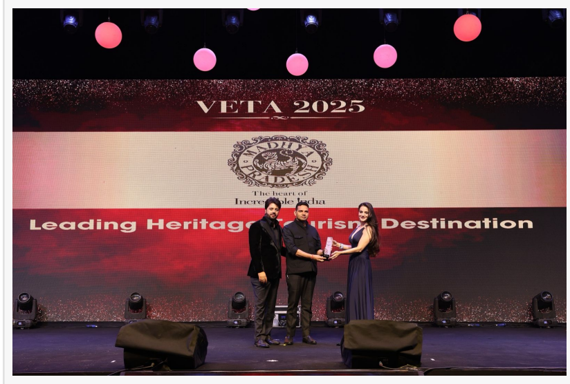
MPTB won the Leading Heritage Tourism Destination Award at VETA 2025

Tourism and Culture and Managing Director of the Madhya Pradesh Tourism Board, highlighted the state's rich array of historical and archaeological sites. He emphasized that this award not only acknowledges the state's strides in responsible tourism but also reflects its dedication to ensuring that the cultural and historical legacy of Madhya Pradesh is preserved for future