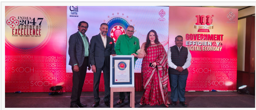
Award for the Project Clean Destination at SKOCH 2025

Further strengthening its environmental focus, the state has also been honored with the SKOCH Award for 'Project Clean Destination'. Launched in 2022 in Panna district and later expanded to Bandhavgarh, this initiative aims to implement structured waste management systems and raise awareness through community collaboration. The Panna National Park's waste management program was also recognized with the Global ESG Award for solid waste