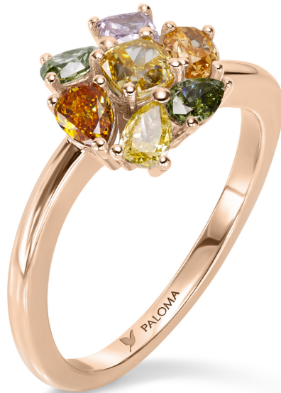
Blossom Statement Ring