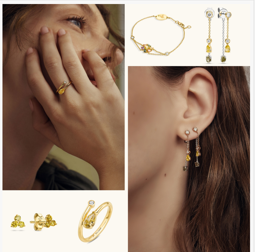
Fancy Color Diamond Jewelry

The Blossom Statement Ring – A luminous expression of warmth, joy, and unwavering strength. Featuring a mesmerizing cluster of multi color and shape diamonds adorn the center of this ring, creating a bold yet elegant look.