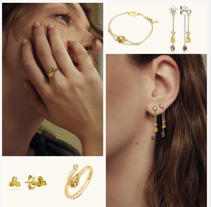
Fancy Color Diamond Jewelry

The Blossom Statement Ring – A luminous expression of warmth, joy, and unwavering strength. Featuring a mesmerizing cluster of multi color and shape diamonds adorn the center of this ring, creating a bold yet elegant look.