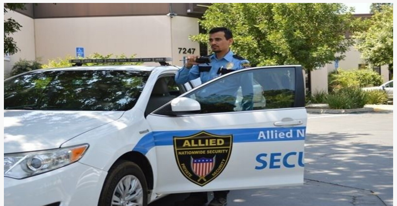
private security guard services 1