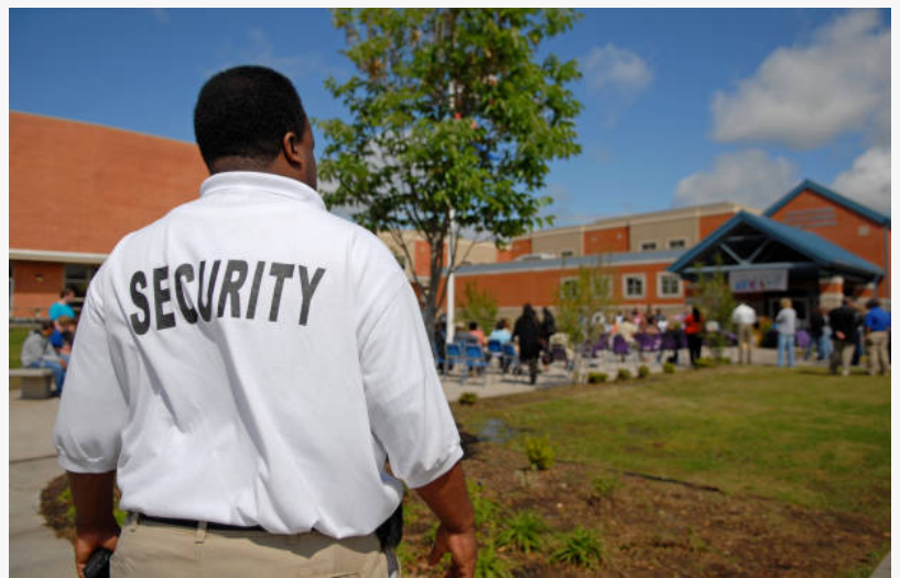
School Security Services 1

Security concerns vary widely depending on the environment. A high-traffic office building requires a different approach than a quiet residential community. Similarly, a retail store facing the risk of shoplifting has different security