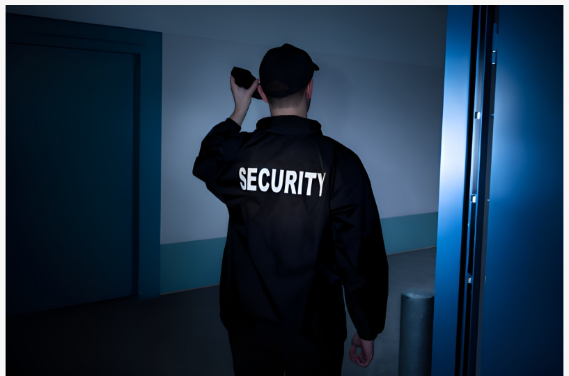
unarmed security guard 1