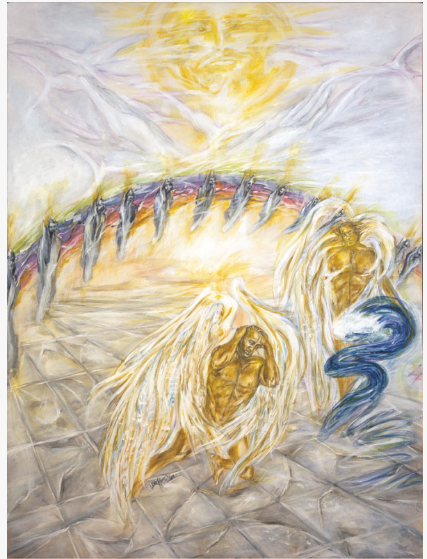
Redemption Art -