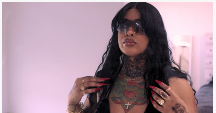
Aquaa Mermaid - "You're OK" - Music Video Still

LOS ANGELES, CA, UNITED STATES, February 26, 2025 /EINPresswire.com/ -- Aquaa (AKA Aquaa Mermaid ), the trailblazing Pop/Rock singer-songwriter and mental health advocate from the Washington DC, DMV area, released her highly anticipated new single, "You're OK," today, February 26. This