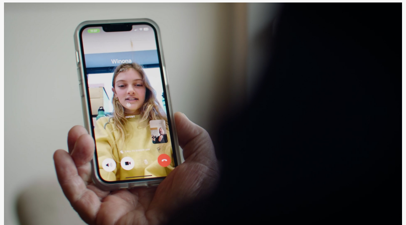
Whispp Speaking on Video