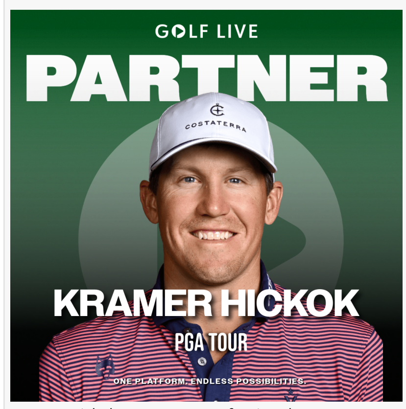
Kramer Hickok - PGA Tour Professional

instruction with Golf Live. Visit <a href="www.golfliveapp.com">www.golfliveapp.com</a> or email contact@golfliveapp.com.