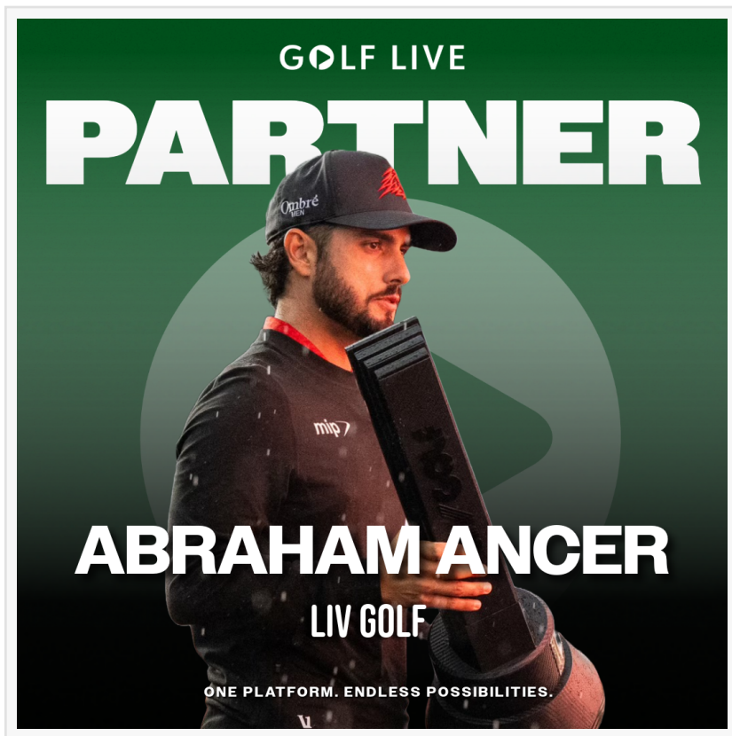
Abraham Ancer - LIV Golf Professional

Golf Live revolutionizes golf instruction with live, virtual video capture and replay. Our patented technology, live video replay, enhances remote coaching through real-time interaction between student and coach. With advanced video analysis tools and automatic lesson storage, instructors can deliver personalized sessions from anywhere eliminating time and travel constraints. Calendar Integration, Multi-tier Memberships, Video Exchange and Analysis, Payment Processing, and Live Stream capabilities provide users with a full complement of coaching and learning tools. Discover the future of golf