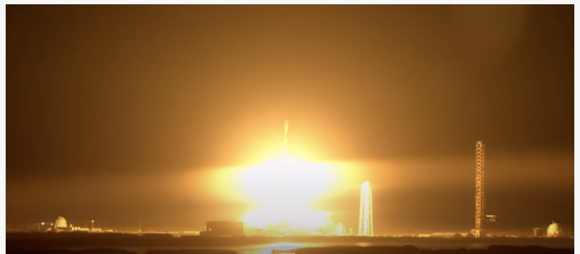
SpaceX - IM-2 Rocket Launch to the Moon