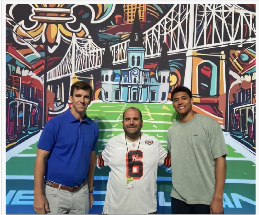
TravelingWiki with NFL Greats Eli Manning & Kyle Hamilton On Special Needs Resources In Advance of Super Bowl LIX