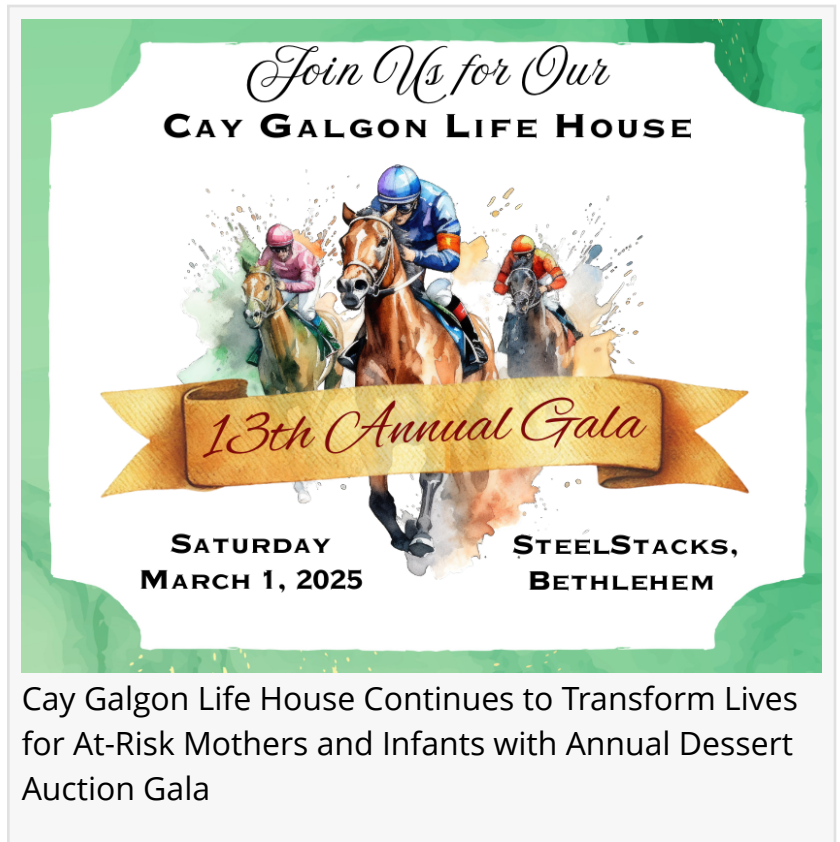
Cay Galgon Life House Continues to Transform Lives for At-Risk Mothers and Infants with Annual Dessert Auction Gala