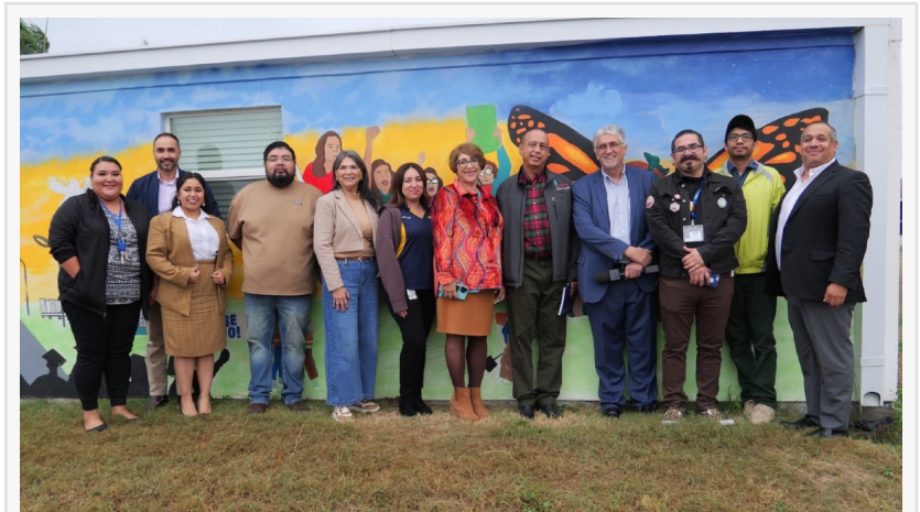
Members of the Rio Grande Valley Broadband Coalition

WESLACO, TX, UNITED STATES, February 25, 2025 /EINPresswire.com/ -- The Rio Grande Valley Broadband Coalition today unveils the RGV Broadband and Digital Opportunity Plan , a bold initiative to ensure every home, business, and community anchor institution in the region has access to affordable, reliable high-speed internet.