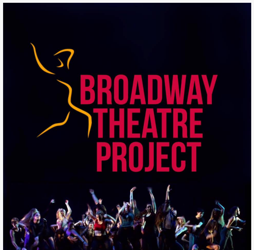
Broadway Theatre Project