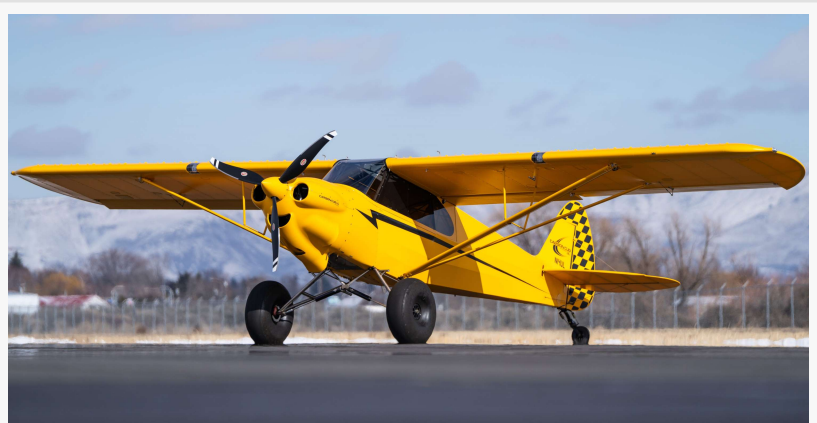
Carbon Cub UL with Kestrel Propeller

"The Kestrel marks the first next-generation propeller for Rotax 916 engines, combining lightweight composite design with high performance aerodynamics," said Hartzell Propeller President JJ Frigge. "It is tailored for the excellent backcountry and cross-country flying capabilities of the STOL Carbon Cub UL," he added.