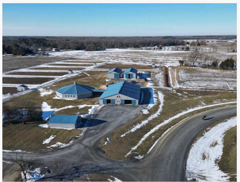
FreeRaceHorse.com high tech training facility

FreeRaceHorse.com respects and admires the many organizations dedicated to retraining and rehoming racehorses. These groups have made significant strides in ensuring safer retirements for many horses. However, FreeRaceHorse.com believes its unique approach solves the problem at its root—long before a horse is ever at risk of the unknown.