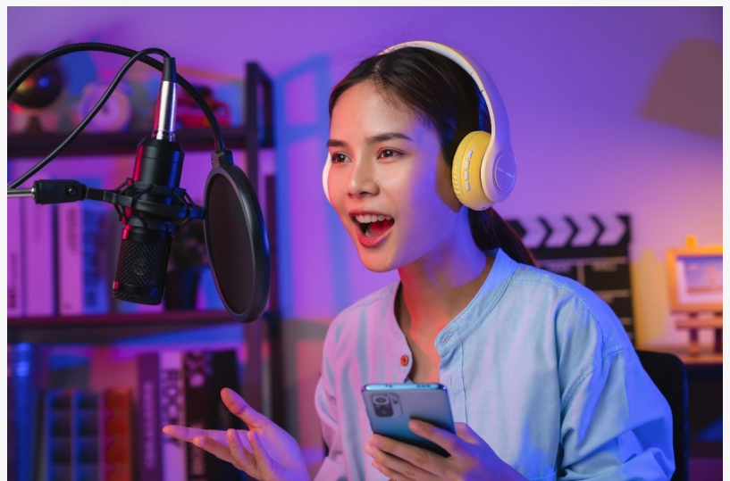
Communication Services Sector News

The sector is divided into two main segments: telecommunications services and media &