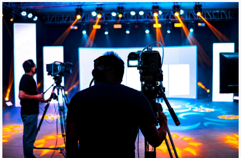
Media & Entertainment News