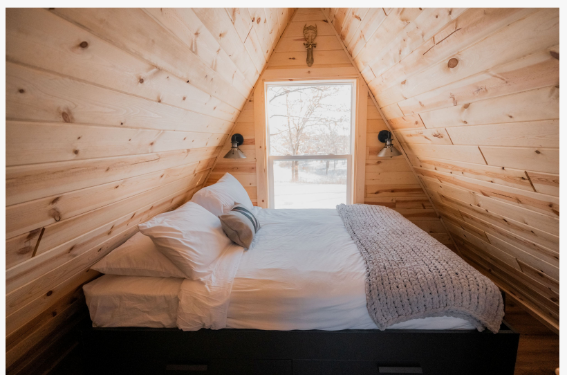
A Frame interior at Big Rock Creek queen sized bed

Located just a short drive from the Twin Cities, Big Rock Creek has gained a reputation for offering exceptional outdoor experiences, including camping, glamping, event hosting, and seasonal attractions like Miracle at Big Rock. The addition of the A-Frame cabin is part of the venue's continued efforts to expand its luxury lodging options and provide guests with unique ways to enjoy the natural beauty of the region.