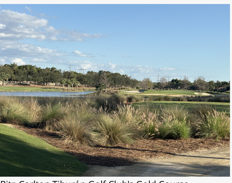
Ritz-Carlton Tiburón Golf Club's Gold Course

This press release can be viewed online at: https://www.einpresswire.com/article/789153967