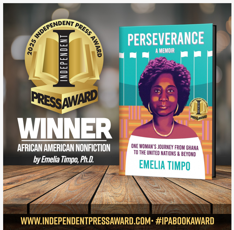
2025 Independent Press Award Winner

The competition is judged by experts from different aspects of the book industry, including publishers, writers, editors, book cover designers and professional copywriters. Selected IPA Award Winners and Distinguished Favorites are based on overall excellence.