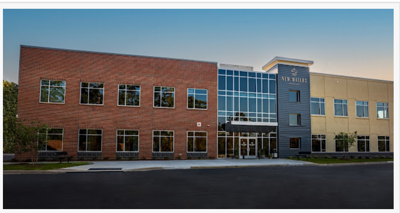
New Waters Recovery Building

Breaking the Cycle of Relapse Addiction treatment should not be a revolving door. Too often, individuals complete outpatient or inpatient rehab only to