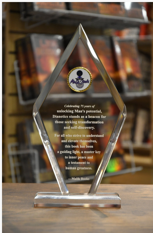
Award from Malik Books honoring 75 years of Dianetics unlocking human potential.