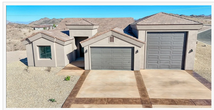
Front view of a modern, affordable house built by Allegiant Homes in Bullhead City, AZ, featuring desert-inspired design and quality craftsmanship

Allegiant Homes prioritizes local employment, hiring skilled workers from Bullhead City and the surrounding Mohave County area to bring each project to life. This not only boosts the local economy but ensures that every home reflects the pride and dedication of the people who call this region home. From open-concept layouts to energy-efficient designs, the company's homes are crafted to meet modern needs while staying true to Ziroli's vision of authenticity and warmth.