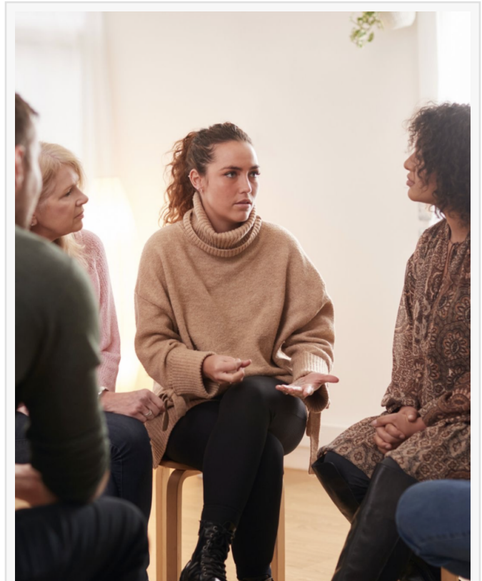
American Friends of NATAL (AFN) announced the launch of the Mental Health Affinity Group, a professional and supportive community created to support mental health professionals and the work of NATAL.